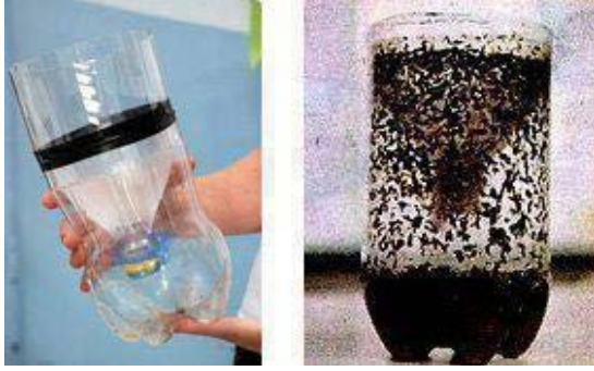
Figure 1: Homemade Mosquito Breeder