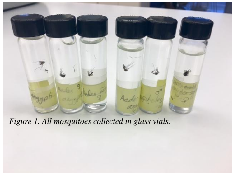
Figure 1. All mosquitoes collected in glass vials.

Mosquitoes were collected from three different areas. The first was 3519 Treeline Dr at The Reserve at College Station apartments. The mosquito collected here was identified as Uranotaenia anhydor syntheta . The second was The Woodlands apartments at 1725 Harvey-Mitchell Parkway. The Anopheles quadrimaculatus mosquito was found at this location. The third location was Parkway Place apartments at 1350 Harvey-Mitchell Parkway. Four Aedes aegypti mosquitoes were found at this location. Attempted collections were also made at Lick Creek Park at 13600 East Rock Prairie Road using two homemade mosquito traps, however, no mosquitoes or larvae were found in the traps.