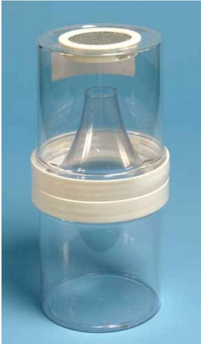
Figure 2. BioQuip Mosquito Breeder